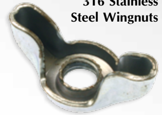
316 Stainless Steel Wingnuts