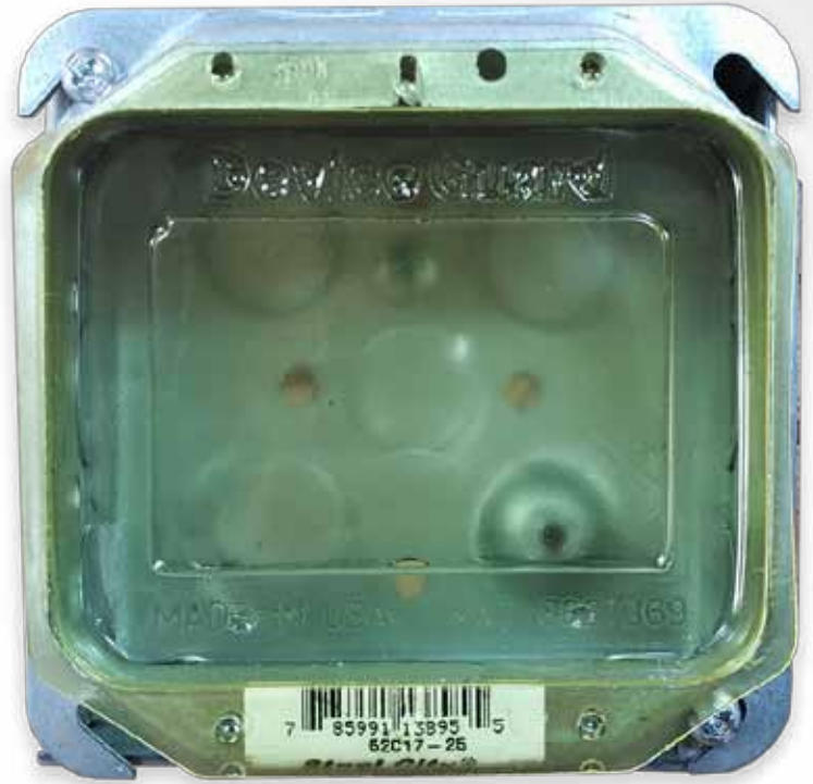
2 Gang Mud Ring Cover