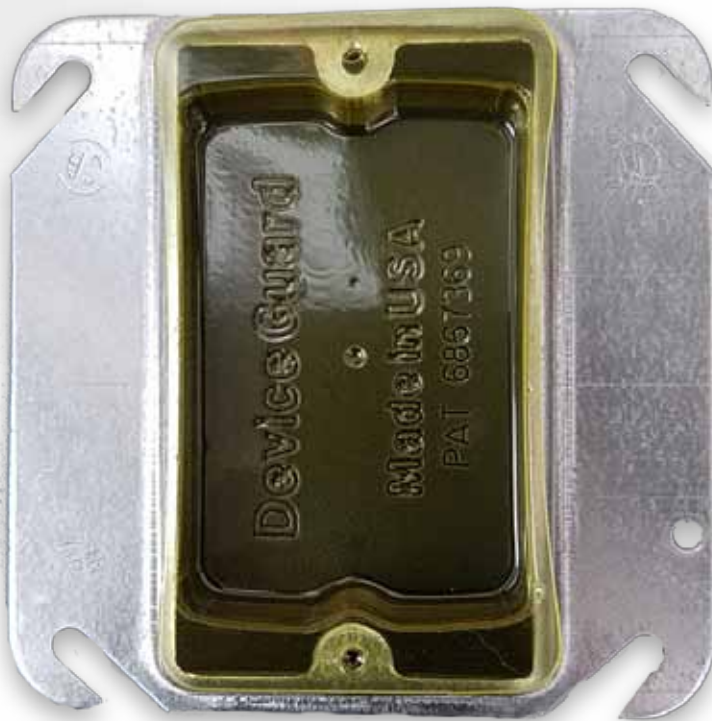
1 Gang Mud Ring Cover

2 gang mud ring cover – 4" H x 3.75" W x .75" D