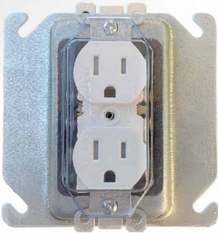
1 Gang Duplex Receptacle Cover with Screws Pre-Installed

2 Gang Receptacle Cover 4" H x 2.25" W x 0.25" D