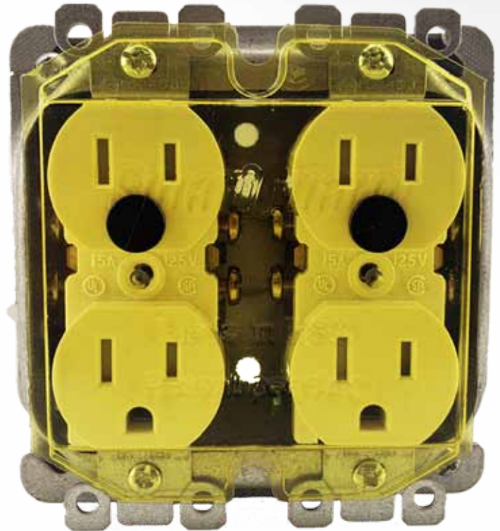
2 Gang Duplex Receptacle Cover with Screws Pre-Installed